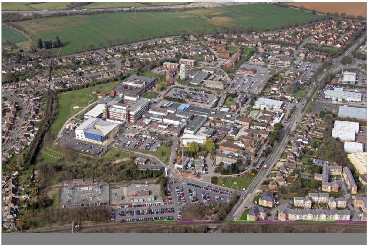
Kettering General Hospital, Rothwell Road, Kettering

An aerial photograph of the hospital site is provided below: